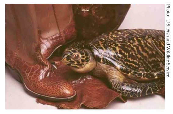
Sea turtle shells and boots are among the seized wildlife products that the Service provides to educators for use in teaching about threats to wildlife

In addition, those holding seized wild animal as a loan cannot transfer custody without prior Service permission. Even donees typically cannot retransfer without Service permission for a specified period of time.