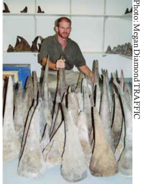
Rhino stock in South Africa