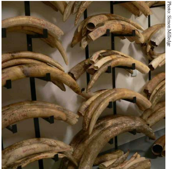
Stockpiled ivory in undisclosed location in South Africa

In reality, stockpiles often include wildlife products derived from legal sources (e.g. natural mortalities, managed off-take, problem animal control, etc.) in addition to confiscated specimens.