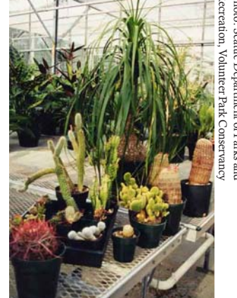
Confiscated CITES plants are placed in public institutions to contribute to conservation, research and education