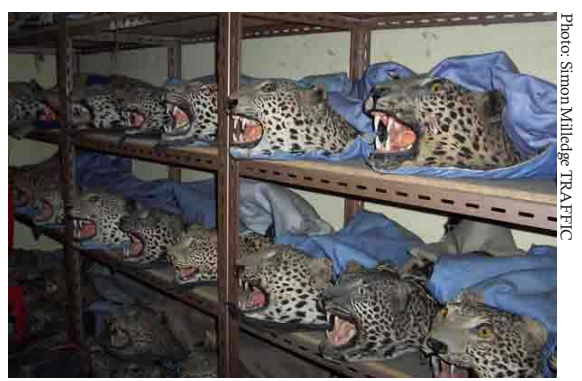
Mounted leopard skins in storage

Adopted at the WAZA Plenary Session of 20 November 2003 – 58th Annual meeting, held at San José, Costa Rica, 2003.