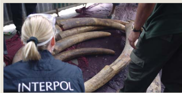
ICCWC WIST in operation in Sri Lanka.

Through the combined experience, technical capacity, communication channels and field networks of the five organizations, ICCWC is uniquely placed to develop programmes to combat wildlife and forest crime against these five areas.