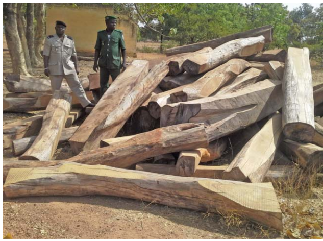
Timber seized in Burkina Faso.

The International Consortium on Combating Wildlife Crime 'ICCWC' is the collaborative effort of five intergovernmental organizations working to bring coordinated support to national wildlife law enforcement agencies and the sub-regional and regional enforcement networks that act in defence of natural resources.