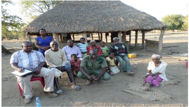
Photo 2. Interview with Local Community about Human elephant conflict