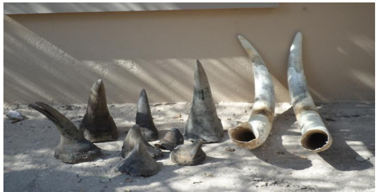
6. Rhino Hons and Ivory Seizures in LNP