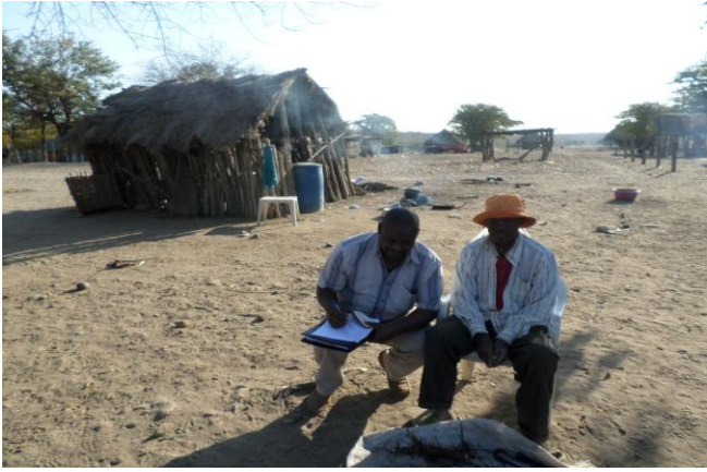
Photo1. Interview about Medicinal Plants in LNP