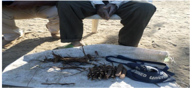
Photo 4. Community member explaining the harvest methods