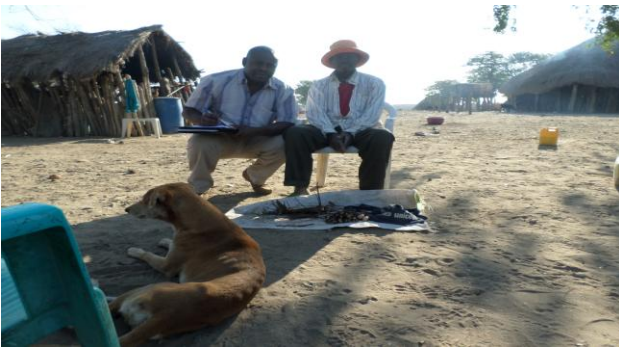
Photo 5. Dog helping during the activities/LNP