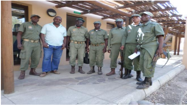
Photo 3. Field rangers of LNP